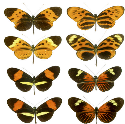
Figure: Mimicry in butterflies