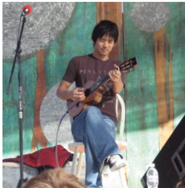
Figure 6.9: In contrast to tacky Hawaiian souvenirs, the quality of Kamaka ukuleles makes them a favorite of ukulele phenom Jake Shimabukuro and others who are willing to pay $1,000 or more for a high-end instrument.

In terms of disadvantages, the limited demand available within a niche can cause problems. First, a firm could find its growth ambitions stymied. Once its target market is being well served, expansion to other markets might be the only way to expand, and this often requires developing a new set of skills. Also, the niche could disappear or be taken over by larger competitors. Many gun stores have struggled and even gone out of business since Walmart and sporting goods stores such as Academy Sports and Bass Pro Shops have started carrying an impressive array of firearms.