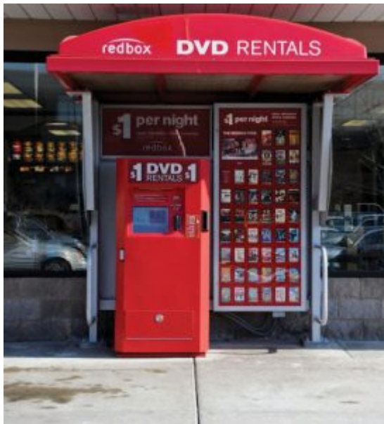
Figure 6.7: Redbox machines are available nationwide.

Focused cost leadership is the first of two focus strategies. A focused cost leadership strategy requires competing based on price to target a narrow market (Table 6.6). A firm that follows this strategy does not necessarily charge the lowest prices in the industry. Instead, it charges low prices relative to other firms that compete within the target market. Redbox, for example, uses vending machines placed outside grocery stores and other retail outlets to rent DVDs of movies for $1. There are ways to view movies even cheaper, such as through the flat-fee streaming video subscriptions offered by Netflix. But among firms that rent actual DVDs, Redbox offers unparalleled levels of low price and high convenience.