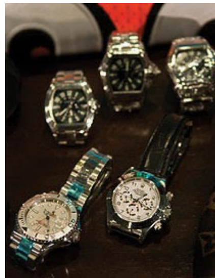
Figure 6.6: Firms following a differentiation strategy must “watch” out for counterfeit goods such as the faux Rolexes shown here.

In other cases, customers desire the unique features that a firm offers, but competitors are able to imitate the features well enough that they are no longer unique. If this happens, customers have no reason to pay a premium for the firm's offerings. IBM experienced the pain of this scenario when executives tried to follow a differentiation strategy in the personal computer market. The strategy had worked for IBM in other areas. Specifically, IBM had enjoyed a great deal of success in the mainframe computer market by providing superior service and charging customers a premium for their mainframes. A business owner who relied on a mainframe to run her company could not afford to have her mainframe out of operation for long. Meanwhile, few businesses had the skills to fix their own mainframes. IBM's message to customers was that they would pay more for IBM's products but that this was a good investment because when a mainframe needed repairs, IBM would provide faster and better service than its competitors could. The customer would thus be open for business again very quickly after a mainframe failure.