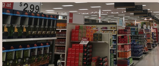
Figure 6.1: Inside of a Target store

On January 13, 2011, Target Corporation announced its intentions to operate stores outside the United States for the first time. The plan called for Target to enter Canada by purchasing existing leases from a Canadian retailer and then opening 100 to 150 stores in 2013 and 2014 (Target, 2011). The chain already included more than 1,700 stores in forty-nine states. Given the close physical and cultural ties between the United States and Canada, entering the Canadian market seemed to be a logical move for Target.