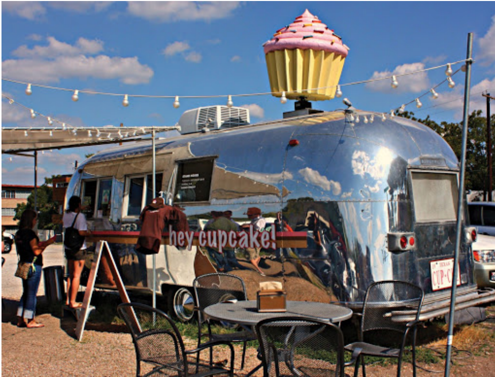
Figure 6.11: Hey Cupcake! in Austin, Texas, is a low-overhead bakery that has become a delicious success.

A best cost strategy offers some important advantages and disadvantages.