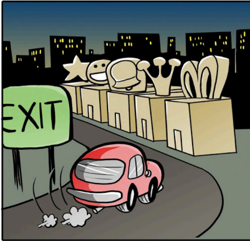
Figure 6.2: Analyzing generic strategies enhances the understanding of how firms compete at the business level.