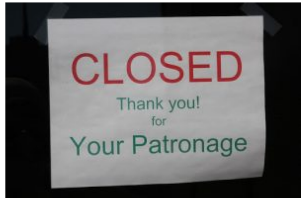
Figure 6.3: Challenging a cost leader in a price war may end up destroying a company.

In many settings, cost leaders attract a large market share because a large portion of potential customers find paying low prices for goods and services of acceptable quality to be very appealing. This is certainly true for Walmart, for example. The need for efficiency means that cost leaders' profit margins are often slimmer than the margins enjoyed by other firms. However, cost leaders' ability to make a little bit of profit from each of a large number of customers means that the total profits of cost leaders can be substantial.