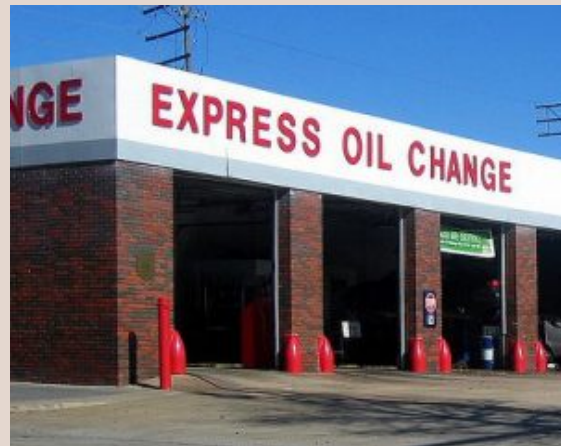
Figure 6.5: Express Oil Change sets itself apart through superior service and great locations.

The auto repair and maintenance business is a pretty competitive space. How is Express Oil Change being positioned relative to other firms, such as Super Lube, American LubeFast, and Jiffy Lube?