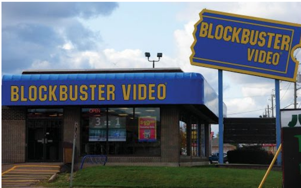
Figure 6.13: Netflix and Redbox have left video rental stores such as Movie Gallery and Blockbuster stuck in the middle. Blockbuster filed for bankruptcy in late 2010.

IBM's personal computer business offers another example. IBM tried to position its personal computers via a differentiation strategy. In particular, IBM's personal computers were offered at high prices, and the firm promised to offer excellent service to customers in return. Unfortunately for IBM, rivals such as Dell were able to provide equal levels of service while selling computers at lower prices. Nothing made IBM's computers stand out from the crowd, and the firm eventually exited the business.