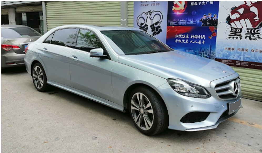
Figure 6.8: Janis Joplin’s musical tribute to Mercedes-Benz underscores the allure of the brand.

Larger niches are served by Whole Foods Market and Mercedes-Benz. Although most grocery stores devote a section of their shelves to natural and organic products, Whole Foods Market works to sell such products exclusively. For customers, the large selection of organic goods comes at a steep price. Indeed, the supermarket’s reputation for high prices has led to a wry nickname—“Whole Paycheck”—but a sizable number of consumers are willing to pay a premium to feel better about the food they buy.