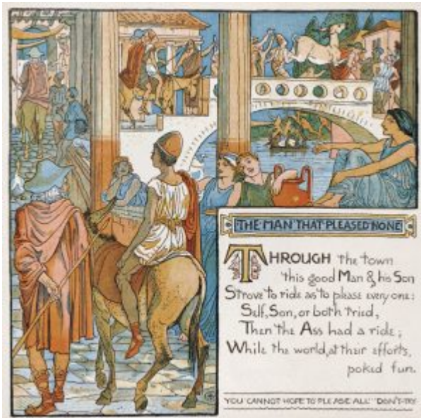
Figure 6.12: This illustration from 1887 captures the lesson of Aesop's fable "The Miller, His Son, and Their Ass"—a lesson that executives need to follow.

Michael Porter has noted that strategy is as much about executives deciding what a firm is not going to do as it is about deciding what the firm is going to do (Porter, 1996). In other words, a firm's business-level strategy should not involve trying to serve the varied needs of different segments of customers in an industry. No firm could possibly pull this off.